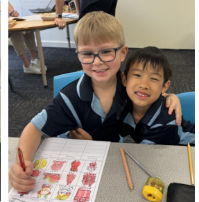
Advent Actions & Good Deeds