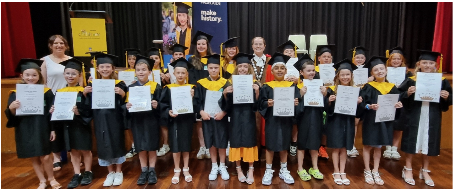
2024 Children's University Graduation - CONGRATULATIONS!