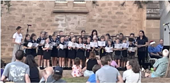
Congratulations to our School Choir

The staff have worked very hard producing End Of Year Reports which will be distributed next Friday at 12.30pm. They include content from the Australian Curriculum. It is essential to understand when a student achieves a C grade, it means that they are demonstrating an understanding of the concepts studied appropriate for their year level. The most significant aspect of the report is the teachers' comment and the